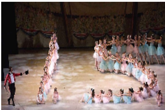
PYBC performing Jerome Robbins' "Circus Polka"