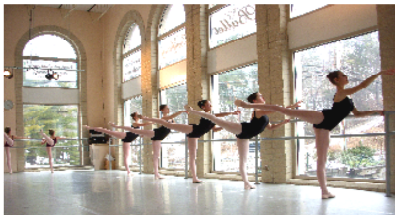
One of PYBC's four Studios

Please note that housing and enrollment is limited and classes are filled in the order in which the completed forms and deposits are received. If we can help you in any way please call our office at (724) 969.6000, or FAX (724) 969.6900 or 412.384.3255, or Email at info@pybco.org . Lastly, we invite to learn more about us by visiting our web site at www.pybco.org as it is under construction and updated almost weekly. Call or email us for a FREE Brochure. We look forward to hearing from you.