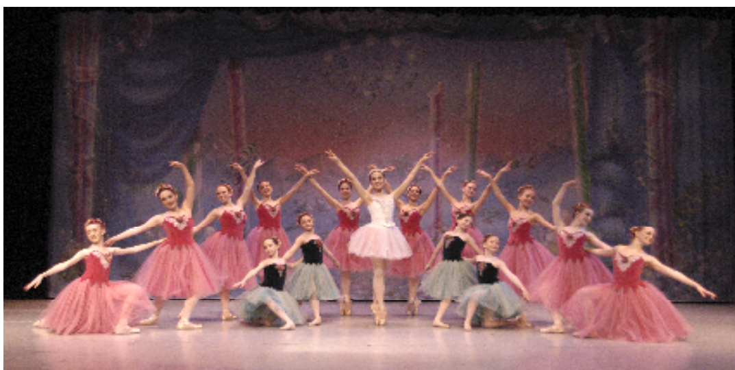
PYBC Nutcracker "Waltz of the Flowers"