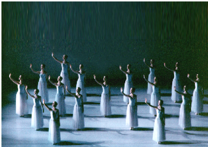
PYBC's "Serenade" Choreography by George Balanchine © The George Balanchine Trust